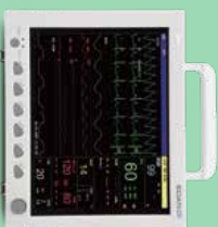
iM8 Series Patient Monitor